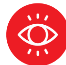
Good landscape integration