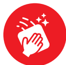
Ease of maintenance