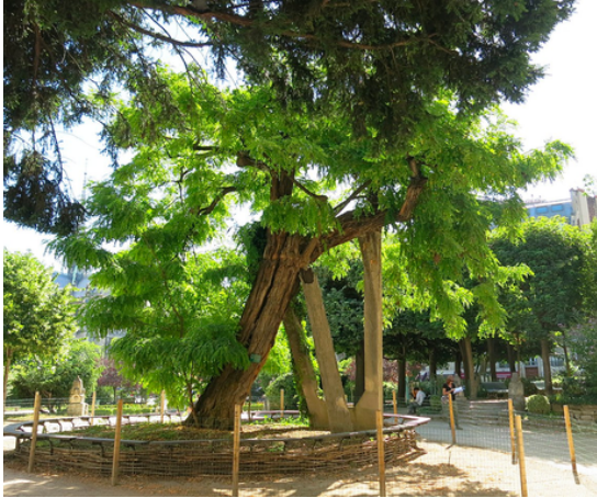
Robinier du Square René-Viviani

The locust tree, also called false-Acacia, was introduced to Europe by Jean Robin, arborist to kings Henry III to Louis XIII, in the 17th century. He received Appalachian seeds from an English naturalist. Although the original tree planted at Place Dauphine has disappeared, its descendants can be seen at Square René-Viviani opposite Notre-Dame and another at the Jardin des Plantes de Paris.