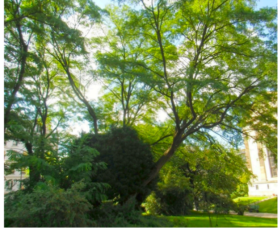
Robinia from the Jardin des Plantes